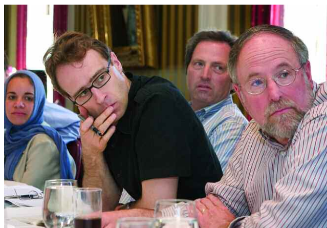
Fellows’ Seminars form the core of the Cogut Center’s fellowship programs.